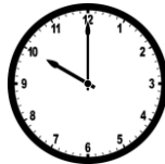
10am Thurs Opening

Site opens at 10am on Thursday and 9am Fri-Sun and closes daily at midnight.